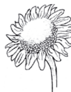
Marcham Moldova Lifeline

Thanks to many people in Marcham, over £10,000 has now been raised for the Marcham Moldova Lifeline, far surpassing our expectations! As a result, we have been able to do a lot more to help some of the poorest people in Europe, through our local partners in Moldova.