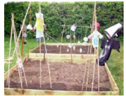
▲ Marcham School's veg patch see page 13