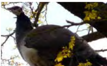
▲ Whose Peahen Is It Anyway? This peripatetic peahen has been sighted all around the village, does anyone want to claim it or is it wild?