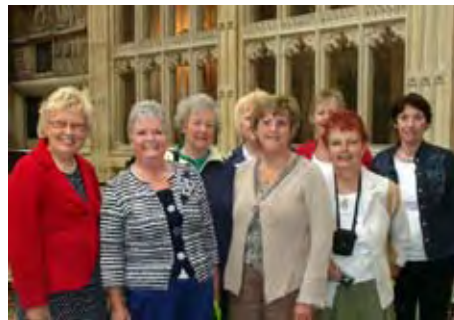
▲ Marcham WI's visit to Bath see page 7