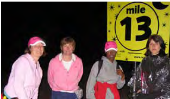
▲ Marcham School Staff on the Playtex Moon Walk see page 13