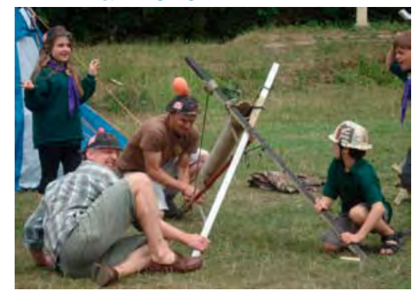
▲ "Testing the Mortar"