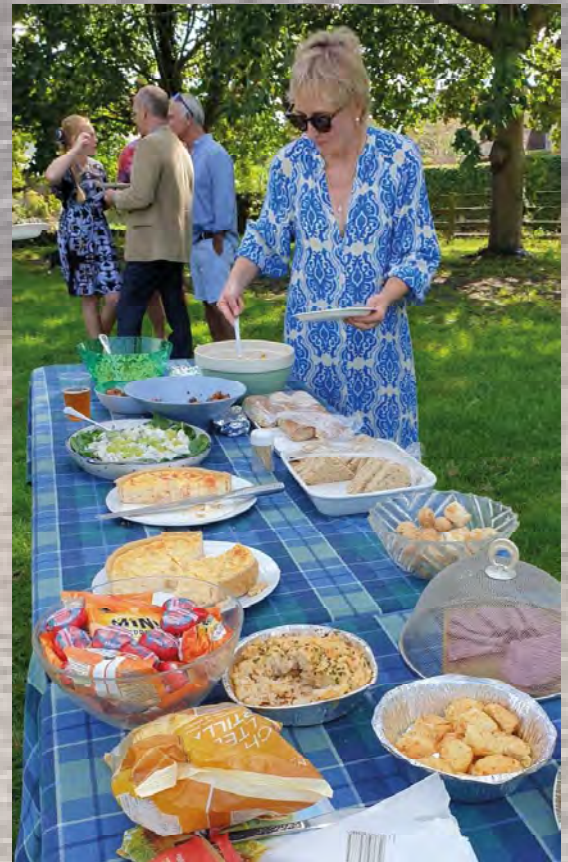
The Bring & Share Lunch