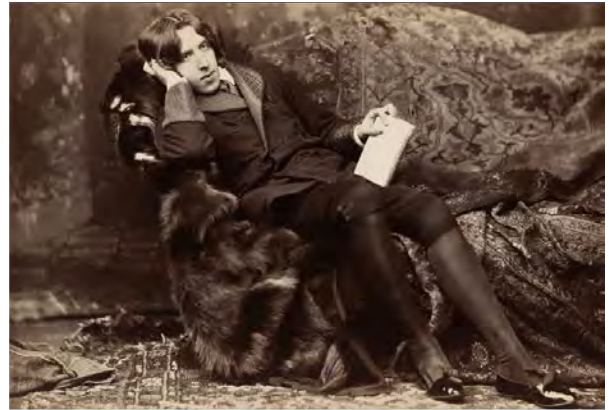
Image: Oscar Wilde by Napoleon Sarony - 1882